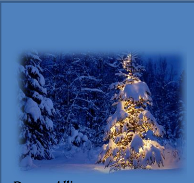
Donor Alliance 720 South Colorado Blvd Suite 800N Denver, CO 80246