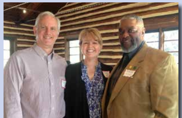
Donor Alliance Advocates and staff mingle while enjoying breakfast at Hudson Gardens Inn